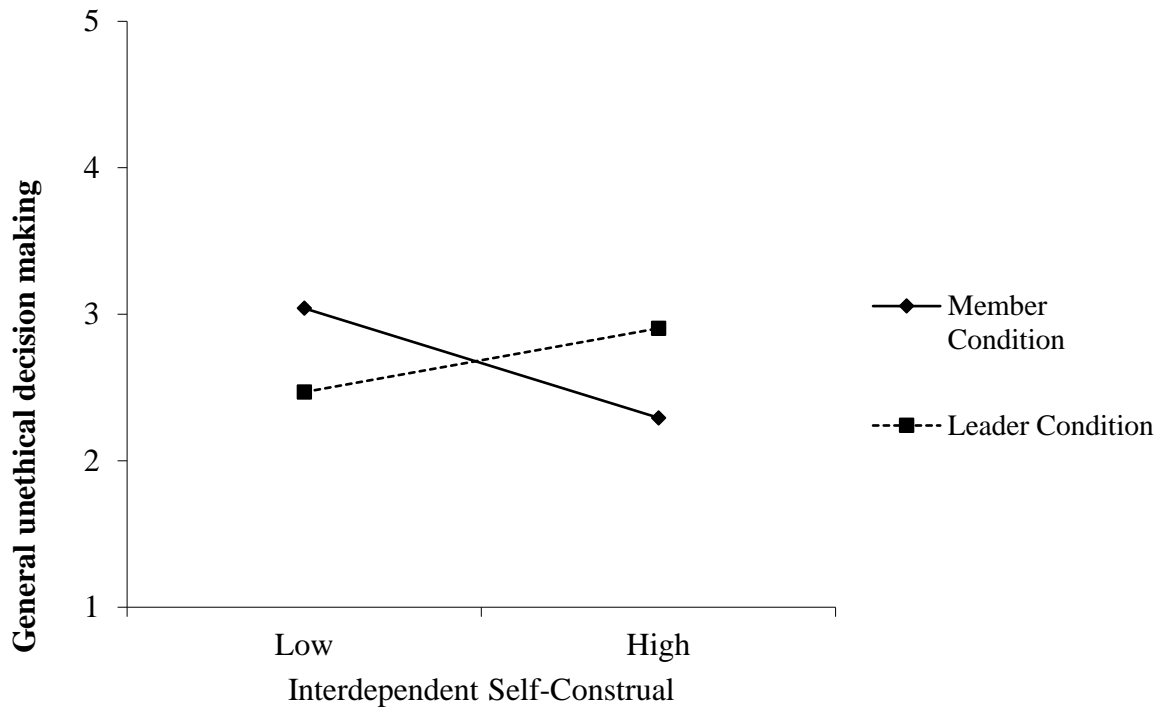
Figure 2. Study 2: Moderating role of leader role in the relationship between interdependent self-construal and general ethical decision making.