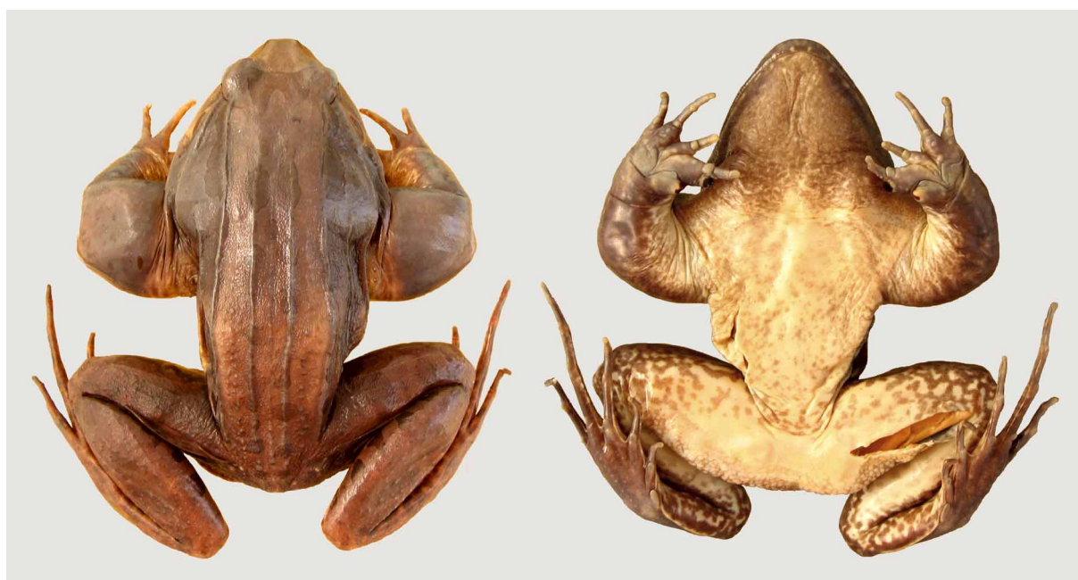
FIGURE 2. Leptodactylus latrans (Steffen, 1815), neotype (MNRJ 30733; 107.0 mm SVL), dorsal and ventral views.

Color: In preservative, general dorsal background color reddish gray; a distinct interocular black spot with two posterior lobes; scattered, rounded black spots on dorsum; a black spot on posterior side of arms; black spots, aligned across the dorsal surfaces of thighs, tibiae, and feet. A black stripe on canthus rostralis, between the nostril and the anterior corner of eye; loreal region uniformly gray, bordered below by small black, approximately triangular spots; border of maxilla gray with light gray spots. Ventral region white with scattered, unshaped small clear gray spots; gular region gray.