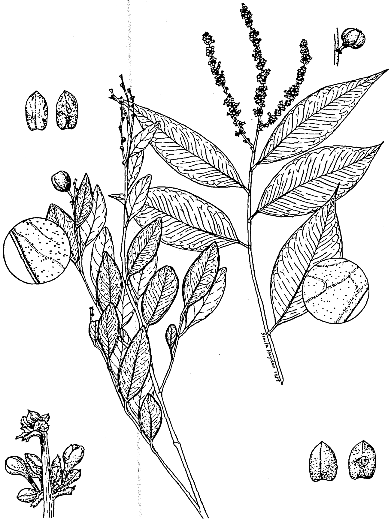
Fig. 92. Amanoa steyermarkii