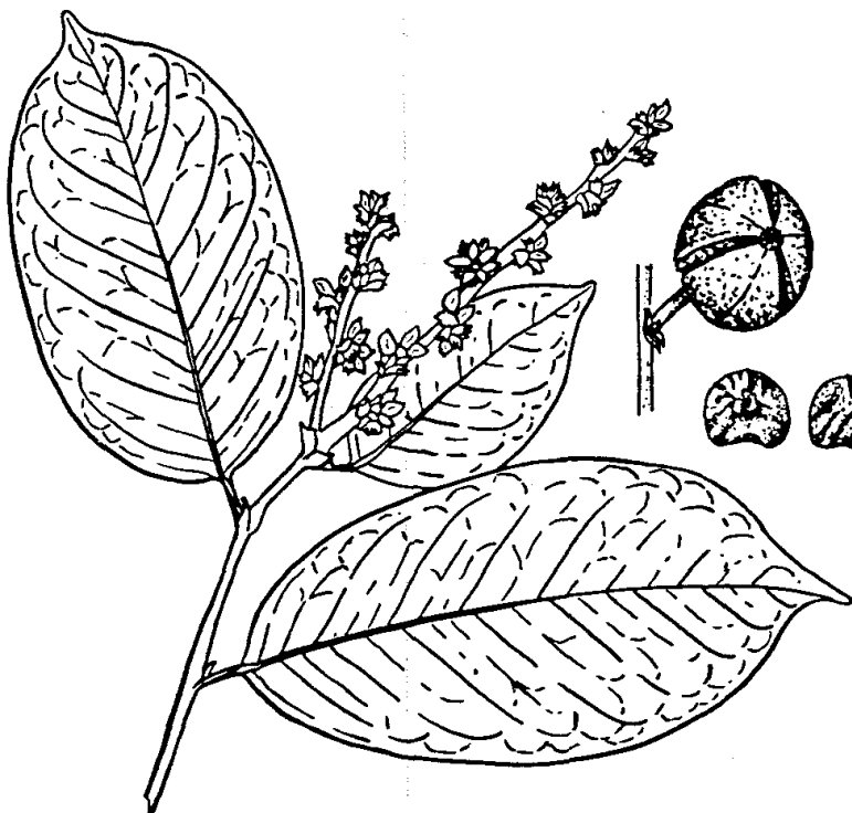
Fig. 96. Amanoa guianensis