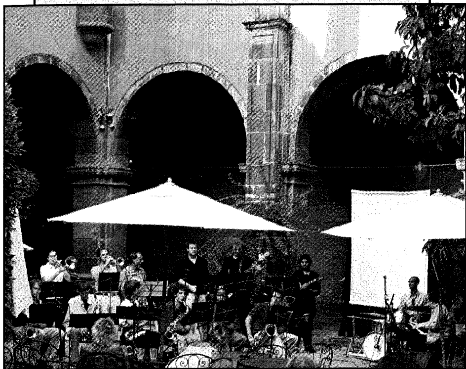
Concert Tour—Mexico Spring 2008