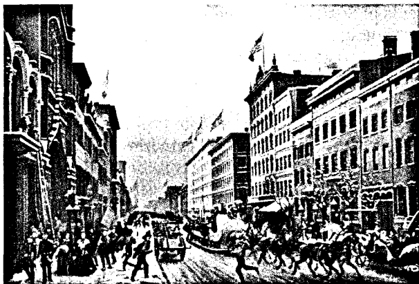
Hippolyte Sebron. Street Scene in New York, 1855.