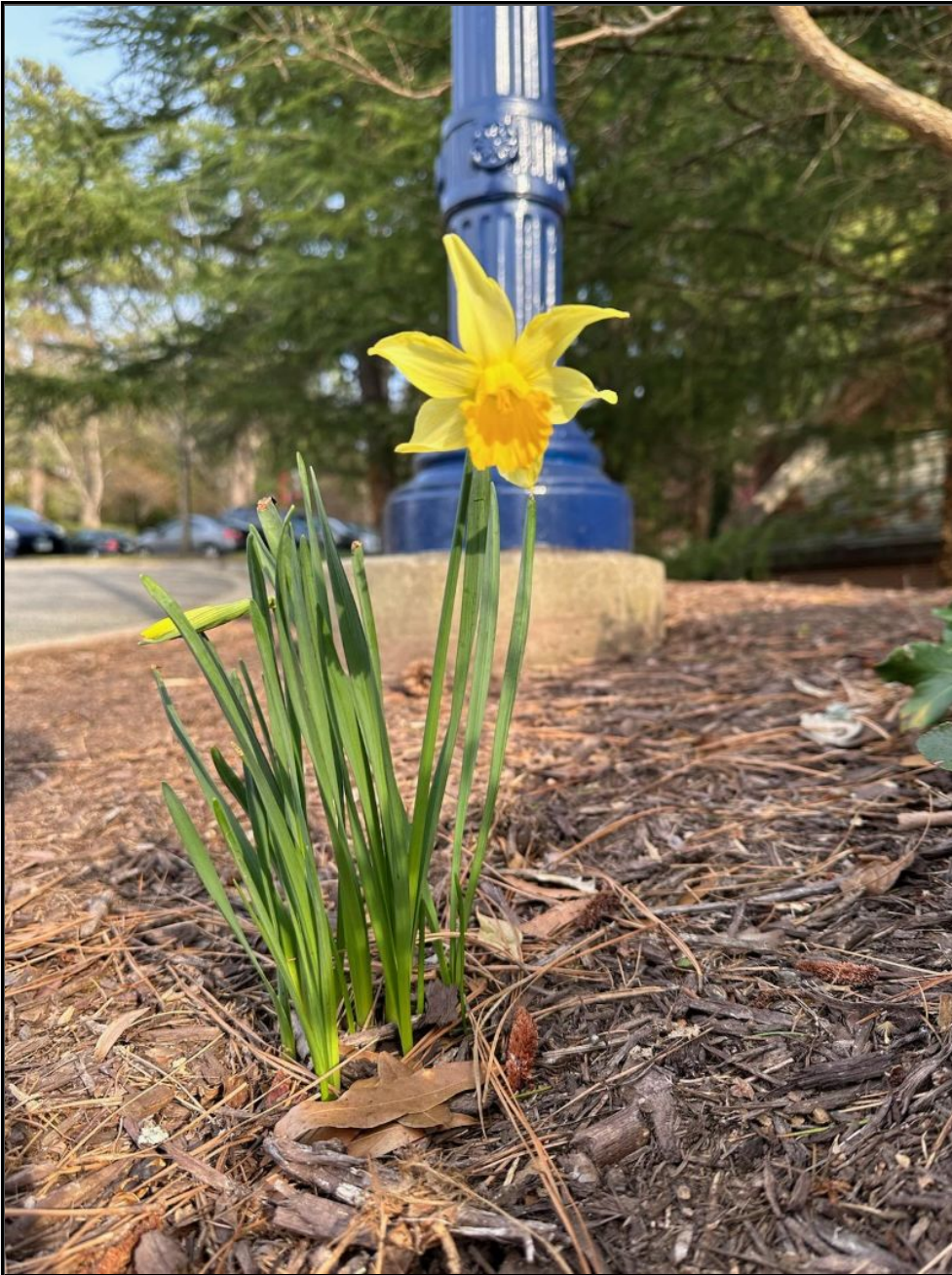
Early Spring daffodil on campus

Ah, February: the month of romance. We at the library hope you had a wonderful Valentine's Day with your special someone. As the good Dr. Seuss once said, "You know you're in love when you can't fall asleep because reality is finally better than your dreams." Are you single? Maybe you just aren't in the mood for love sonnets from the Cat in the Hat? For those whose relationship status is more table for one, drinks for two , we are here for you, too. The library offers quiet study spaces to curl up solo with your favorite casebook. So go ahead and crack open up that half-off Whitman's Sampler you got in the CVS discount bin and enjoy the alone time—you aren't single , you're self-partnered . You've got to take your midterms alone anyway, right? Let's catch you up on the library news.