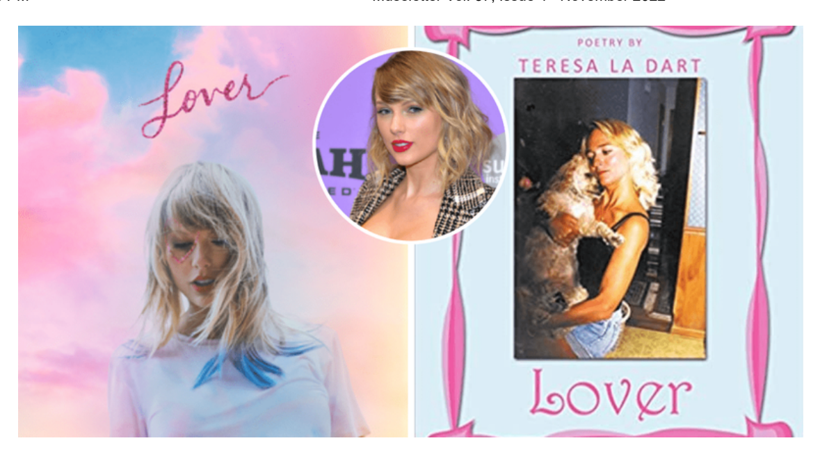
...Ready for it? It's another Facepalm, Taylor Swift edition!

The genre-spanning, bajillion-album-selling pop star has been racking up w's lately. With her latest album, Midnights , Swift broke 185 million Spotify streams in one day (a record) and has become the first artist to monopolize the top 10 Billboard spots at one time (another record). I guess she's kind of a big deal. But with great fame comes great litigation, and Swift has been busy in court. Let the sparks fly!