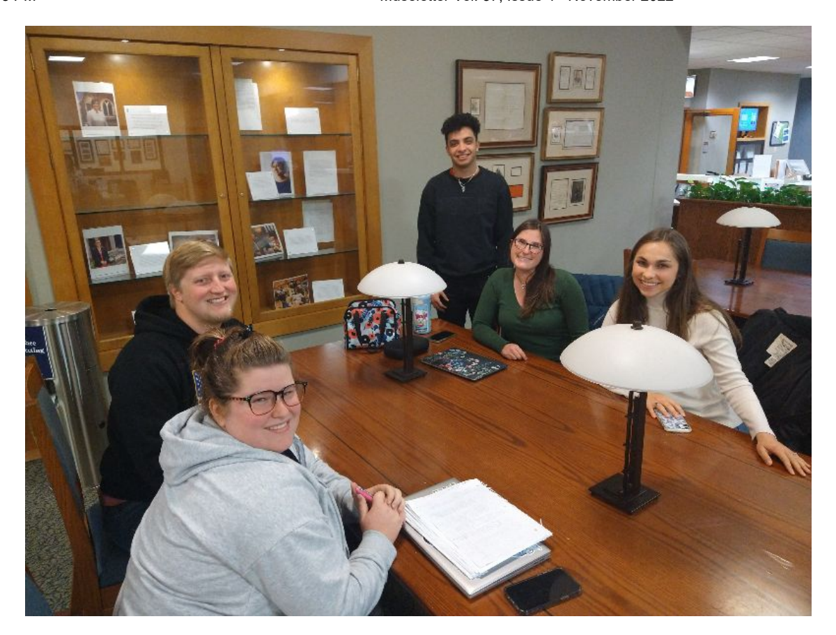
1Ls celebrate the end of the term in the Law Library (Nov. 18, 2022)

As the winter approaches nights get a little longer, days get a little colder, and the world once again transforms into a holiday wonderland. We transition from autumn's pumpkin-spiceageddon to winter's peppermint-mochapocalypse. Ever had white chocolate peppermint Pringles? (It's a real thing). As we approach the end of the year and the end of the term, it's a chance for us to reflect and give thanks to everyone who made the journey wonderful. From the library, we thank all our students, faculty, and staff that have made this term so special. Enjoy your winter break, and good luck on finals. But first, the library news.