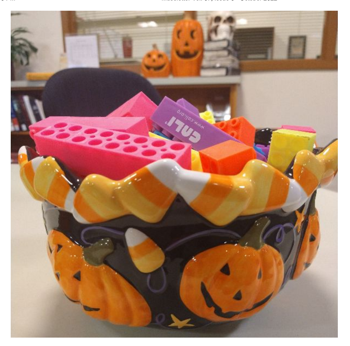
Trick 'r treat! This one's a trick. We'll replace these terrible highlighters with candy soon. (Oct. 20, 2022)

Halloween is one of my favorite times of the year. What other day of the year can you justify dressing up like Darth Vader and eating your weight in Reese's cups? It's the magic time when the leaves turn orange, the corn turns candy, and the Counts turn Chocula. When you can literally pumpkin-spice everything in your life (ever try <a href="mailto:pumpkin spice ramen noodles">pumpkin-spice</a> everything in your life (ever try <a href="pumpkin spice ramen noodles">pumpkin spice ramen noodles</a>? It's a real thing). As a law student, you are coming out of the mid-term grind, and we feel like you deserve a few treats. Check out the Law Library's annual <a href="#halloween horror movie recommendations">Halloween horror movie recommendations</a>, provided by our faculty, staff, and SLATE members. And stop by the Reference Desk on Halloween---we'll have candy!