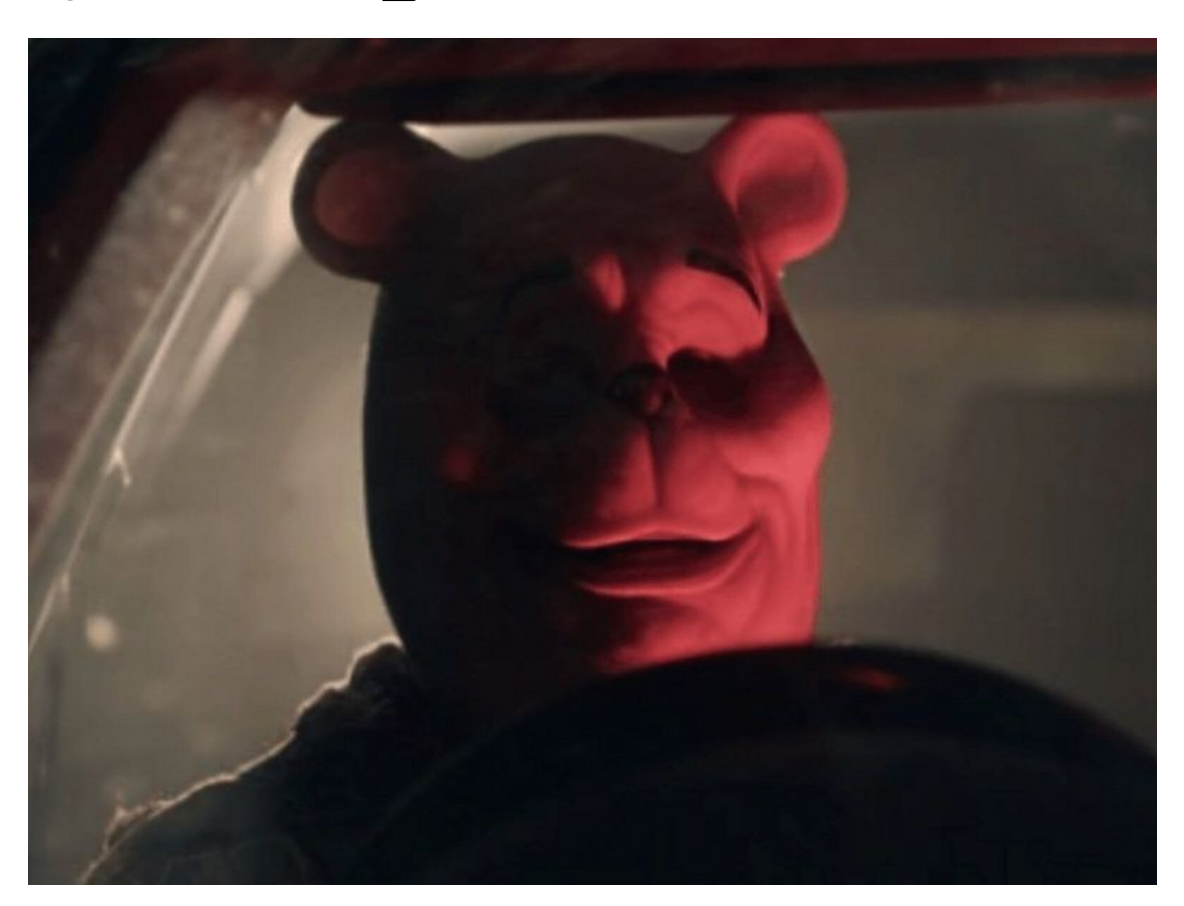
Be afraid. Be very afraid. Another Facepalm is here!

It's Halloween, and during the month of October I gorge myself on horror movies like a school kid eats mini Snickers. But there's nothing Fun Sized about some recent litigation surrounding horror movies, with millions of dollars at stake.