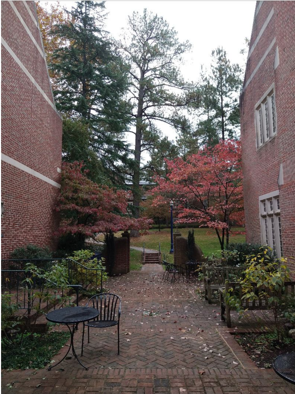
Fall colors on campus (photo by Alex Clay Hutchings, November 10, 2021)

As the holiday season approaches, we are reminded to give thanks for all the little gifts in our lives. For law students, the biggest gifts are likely to be that Fall semester is ending and winter break is right around the corner. Let's give thanks for changing leaves, upcoming parties, catching up on sleep, binge-watching TV, and