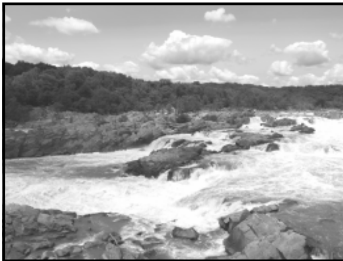
Great Falls is a geologic highlight of the Potomac Gorge

river cut lower and lower, it left numerous bedrock terraces along the sides. The river has also migrated to the south over geological time and continually carved away at the Virginia side, creating an almost continuous line of steep bluffs and cliffs. Unlike most eastern rivers its size, the Potomac has no high dams and it is powerful enough to completely obliterate and then recreate floodplain habitats. It has fostered the dispersal and migration of plants over several physiographic provinces creating rich and diverse plant communities. Furthermore, much of the gorge has been protected on both sides of the river by federal and lo-