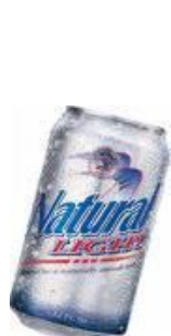
12 oz beer can

Examples: Smirnoff (not ice: 80-proof), Pinnacle (80-proof), Absolut Vodka (80-proof), Captain Morgan (100-proof), Malibu (42-proof), Jose Cuervo (80-proof), Jagermeister (70-proof)