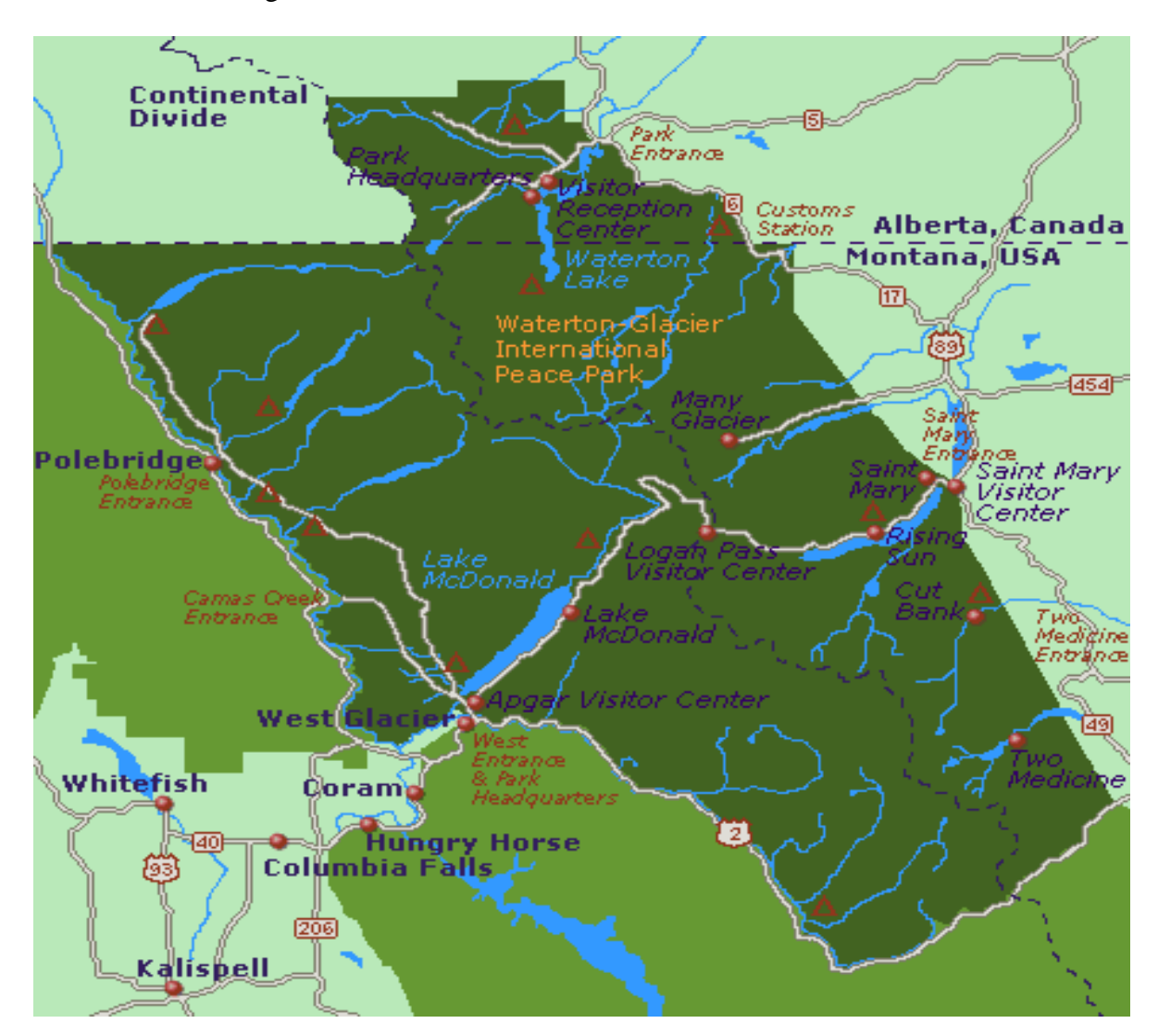
Figure 1. Map of the border between US and Canada at the Alberta & Montana line.

The Waterton Glacier International Peace Park is made up of an array of diverse landscapes stretching across the border of the US and Canada between Alberta and NW Montana, as seen in figure 1.