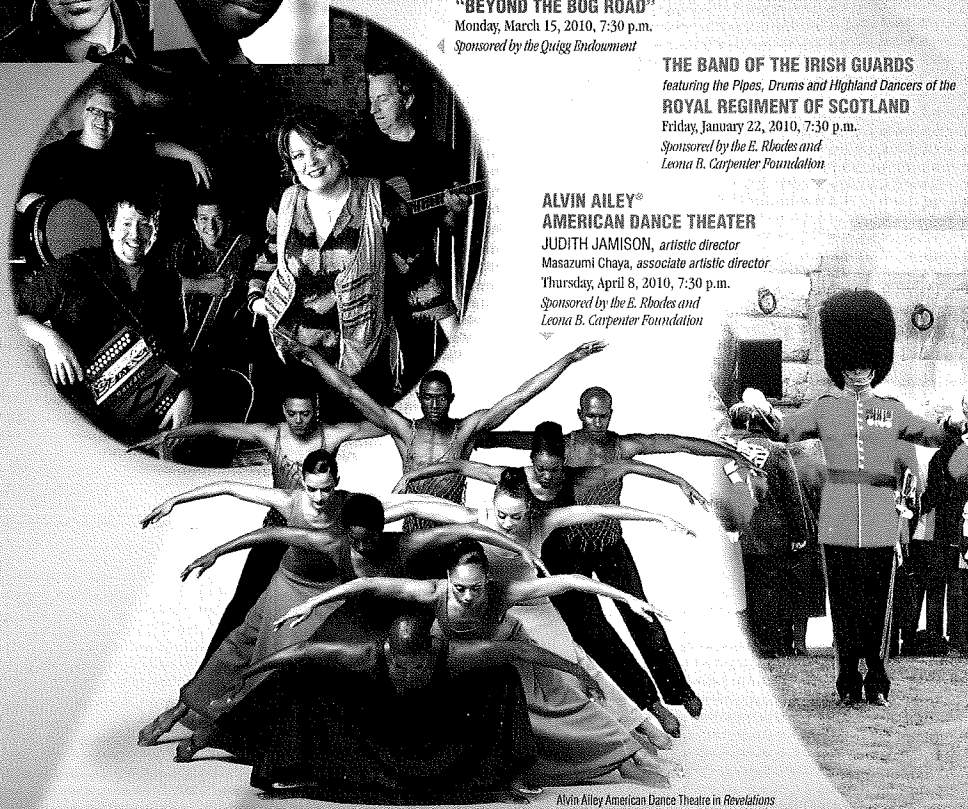
Alvin Ailey American Dance Theatre in Revelations

Sponsored by the E. Rhodes and Leona B. Carpenter Foundation