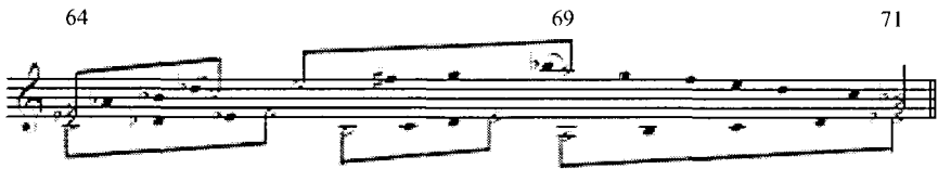
Example 3. Canzona , bars 64-71

achieved by voice-leading and rhythmic placement (Example 3). "Certainty" is nevertheless short-lived when the process begins anew with the succeeding section. By such or similar means A2 "modulates" to A minor in bars 31 and 42, A3 to B-flat minor in bars 45 and 121, B2 to D minor in bar 97, and A1 to G minor in bar 127. Likewise, the ambiguity-certainty principle is reflected by rhythms: emphasis of the downbeat is consistently avoided within each section until its conclusion, normally heralded by a crescendo.