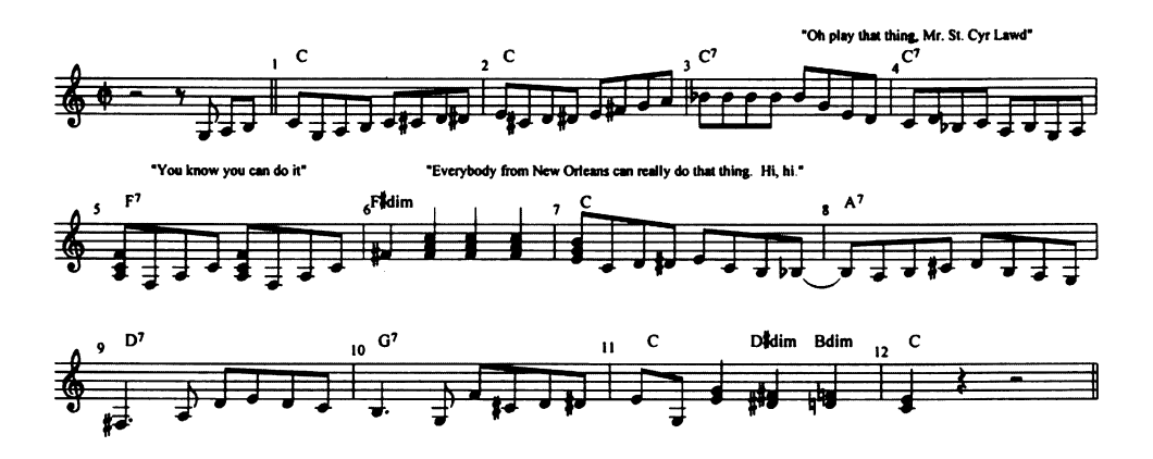
Example 1: St. Cyr's Opening solo in "Gut Bucket Blues."

Incidently, the copyright deposit of "Gut Bucket Blues" offers no compositional insights. Submitted several months after the recording, it is a descriptive lead-sheet incorrectly transcribed by Lil from the recording or from memory (Illustration 2 ["Gut Bucket Blues" copyright deposit]).<sup>33</sup> The introduction has thirteen bars instead of twelve and bars 1-2