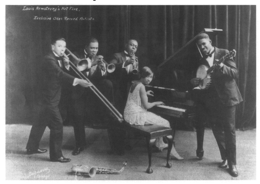
Illustration 1. Louis Armstrong's Hot Five

Cyr's progression differs, in fact, from that followed in the rest of the piece: C-F7-C-C7/F7-F7-C-A7/G7-F7-C-C.