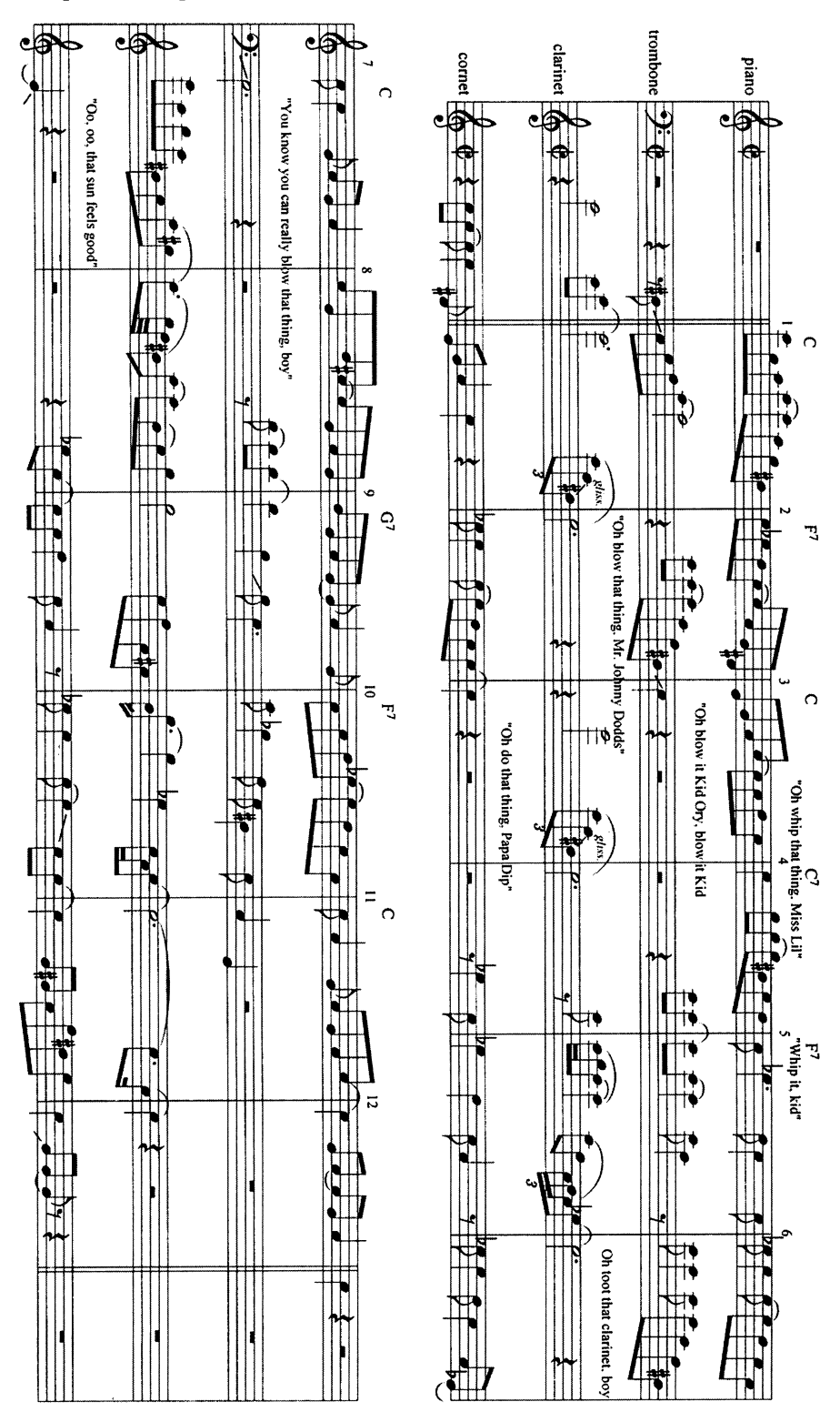
Example 2: Comparison of Solos from "Gut Bucket Blues."