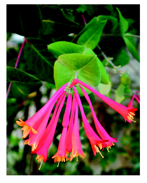
VNPS 2014 Wildflower of the Year Coral Honeysuckle

But it takes more than a hormonal signal to make a new root: living cells need to receive the signal and then respond to it. In honeysuckles, it is parenchyma cells of the leaf gap that respond by initiation of root growth. Normally these would-be mature cells are no longer undergoing cell division, but another response to auxin is the reversion of these mature leaf gap parenchyma cells to a meristem-like state, producing a cluster of rapidly dividing cells that eventually self-organizes as a root apical meristem. In other plants there may be different locations for new root initial formation, but it is always near the stem's vascular tissue. Some commonly noted-locations include between the xylem and phloem of a vascular bundle, completely within the ph-