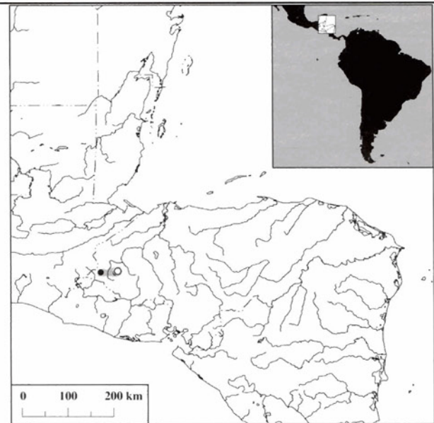
MAP. Distribution of Leptodactylus silvanimbus . The circle marks the type locality and another nearby site; the dot indicates the other locality known for the species.

The advertisement call consists of a single note per call, given at a rate of 17–27/min (Heyer et al. 1996) or 40–64/min (Wilson et al. 1986). Call duration ranges from 0.15–0.17 s. The call has about 160 partial pulses/s. The frequency of the call is weakly modulated, first rising and then falling, the modulation not discernible to the human ear. The intensity of the call is weakly modulated, reaching its loudest intensity by the first quarter to third of the call and maintaining the intensity for much of the remainder. The dominant frequency is the fundamental