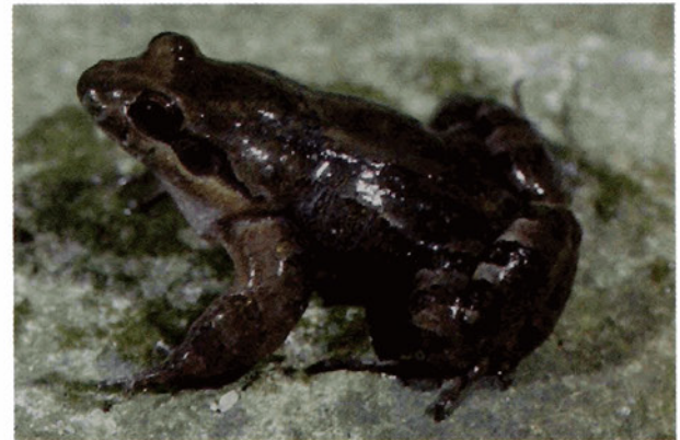
FIGURE 1. Leptodactylus silvanimbus , USNM 509803, male, 43.3 mm SVL, Belén Gualcho, Honduras.