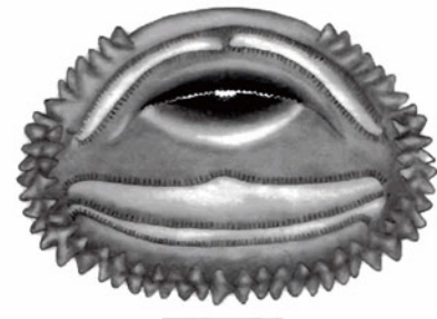
FIGURE 3. Oral disk of Leptodactylus silvanimbus (after McCranie et al. 1986). Bar = 1 mm.