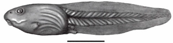
FIGURE 2. Tadpole of Leptodactylus silvanimbus , USNM 544379, Gosner stage 35. Bar = 1 cm.