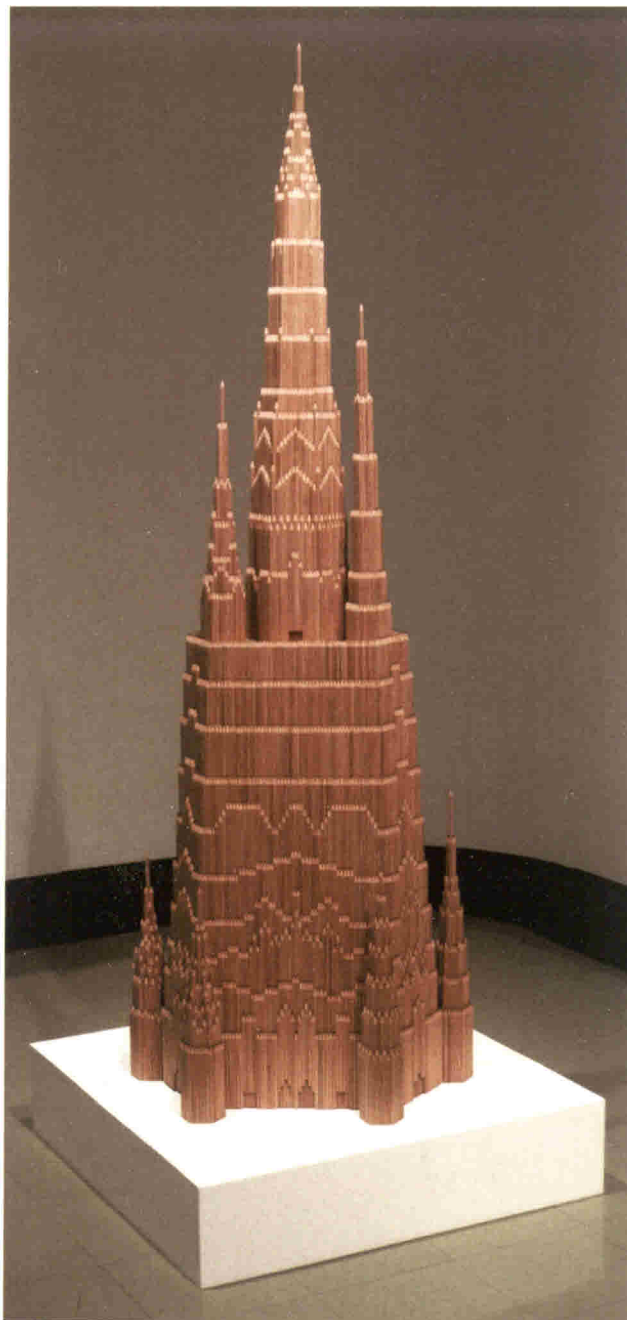
The Art Guys (Michael Galbreth, American, born 1956, and Jack Massing, American, born 1959), Bonded Ability #55 (Skyscraper) , 1999, pencils and glue, 84 x 36 x 36 inches, Courtesy The Art Guys (photograph courtesy AG Worldwide Photo)