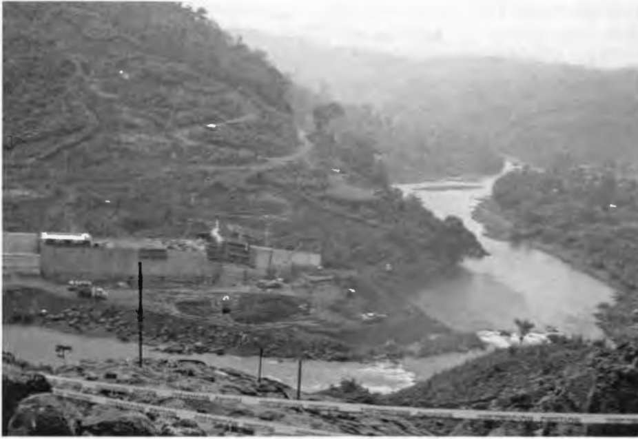
Figure 2. Chan 75 dam in relation to a Ngöbe village (upper right).

efficient production. Moreover, they are receiving training on the sustainable environmental management the communities must adhere to” (AES-Changuinola 2008, 47).