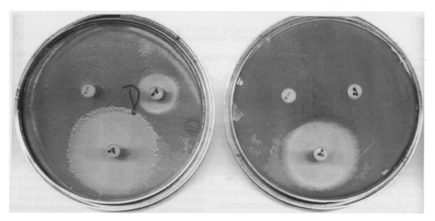
Figure 1. Petri plates containing Missouri River isolates being tested for antibiotic resistance using the disk diffusion technique. Sensi-Discs<sup>TM</sup> are shown with inhibition zones (clearing of microbial growth), which are measured to determine the level of antibiotic susceptibility.

The objectives of this study were twofold. First, we wanted to survey the density of coliforms in the Missouri River across a seasonal shift (winter to spring). Second, we wanted to determine whether these coliforms represented a reservoir of antibiotic resistance. We predicted that there would be a correlation between microbe density and rainfall events, with spring rains contributing to an increase in coliform density. We also predicted that we would isolate coliforms from river water that were antibiotic resistant.