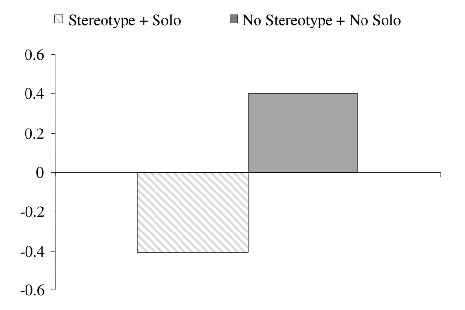
Changes in Self-Appraisals